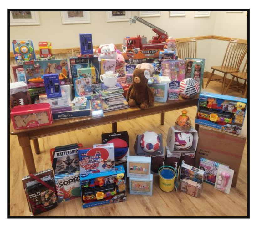
Toys for Tots Totals!

Thank you to everyone who contributed to our Toys for Tots drive. We collected 156 toys and 2 large boxes of beanie babies. Most of the toys came from the yard sale profits and collection plate donations. It was a great collection!